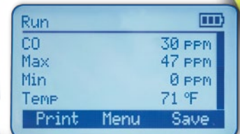
Standard and graphic trending screen toggle options for real-time data display.